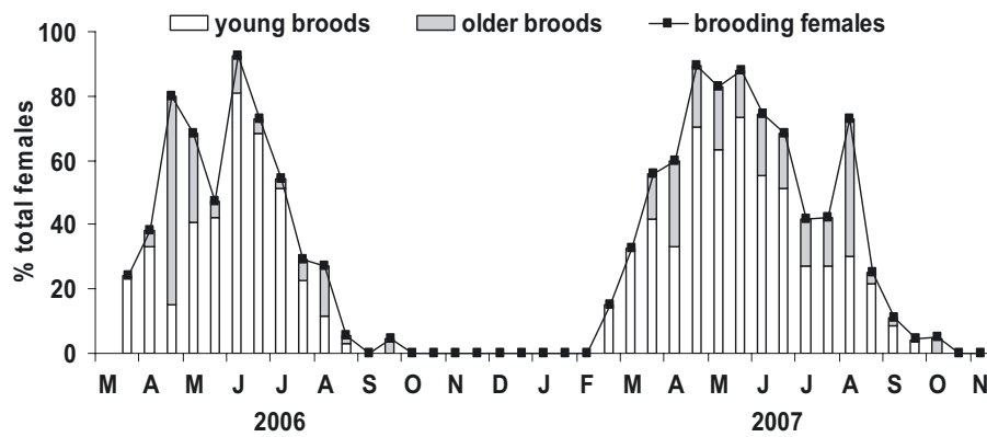
Fig. 1. Evolution of the percentage of brooding females (curve) within the female population of Crepidula formicata , and frequency of young and older broods (cumulative histograms), between mid-March 2006 and November 2007.